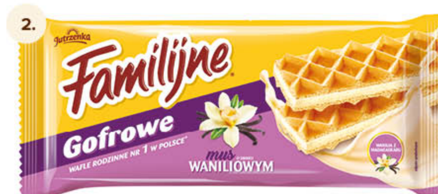
2. Familijne EXTRA CRUNCHY - vanilla 130 g