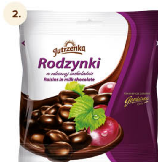
Raisins covered with milk chocolate 80 g