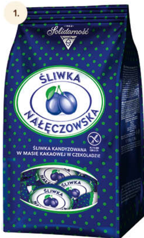
Naleczowska Plum in chocolate** 350 g