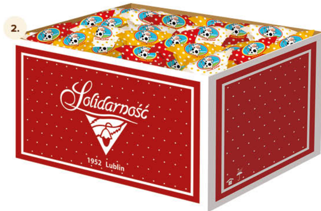
Cream fudge** 3 kg