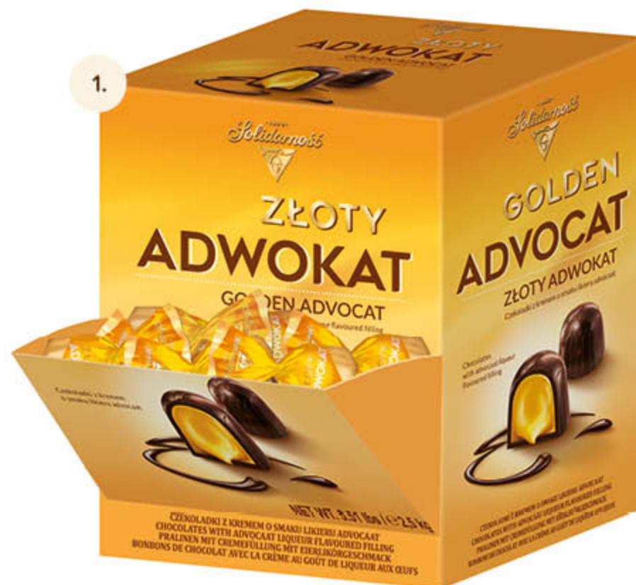
Golden Advocat* 2.5 kg