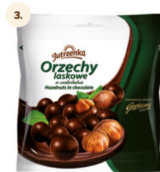
Hazelnuts covered with milk chocolate 80 g