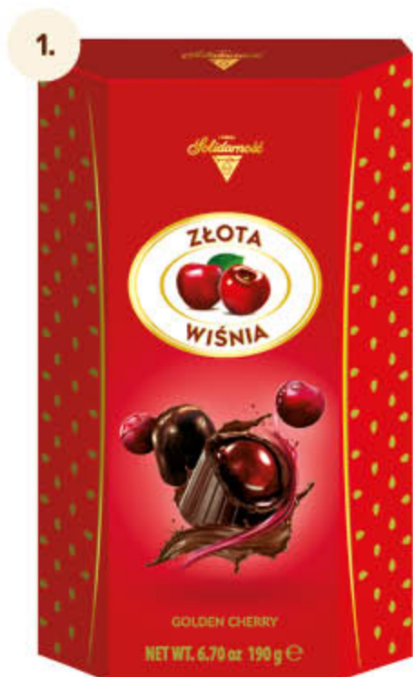
Golden Cherry* 190 g