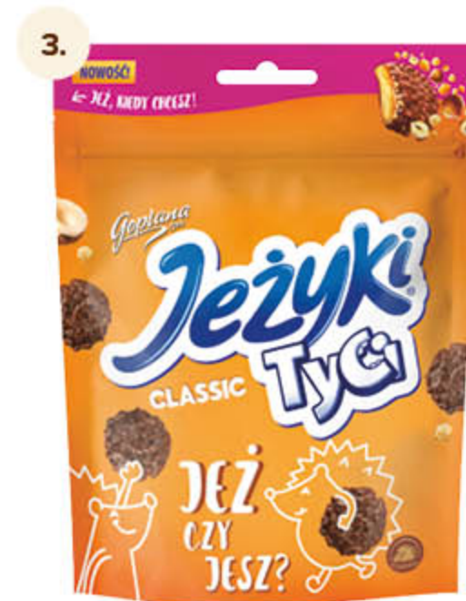
Jeżyki Tyci - classic 100 g