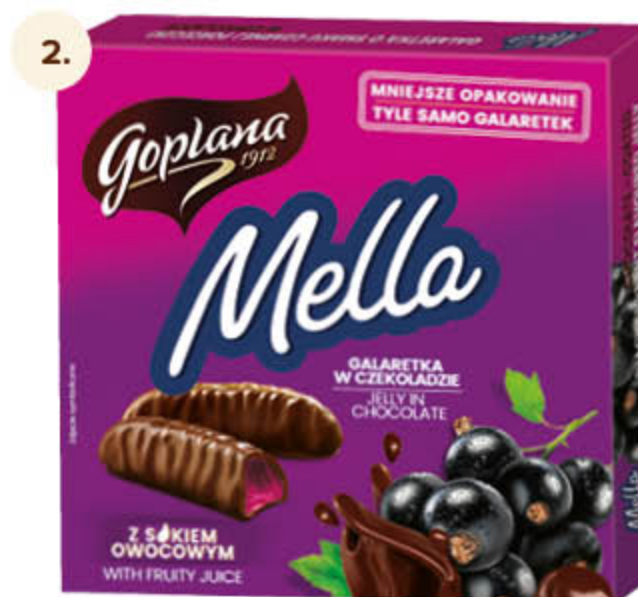
Jelly in dark chocolate with blackcurrant flavour 190 g