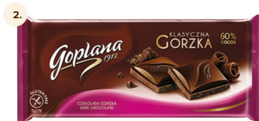
Classic Dark chocolate** 90 g 60% cacao