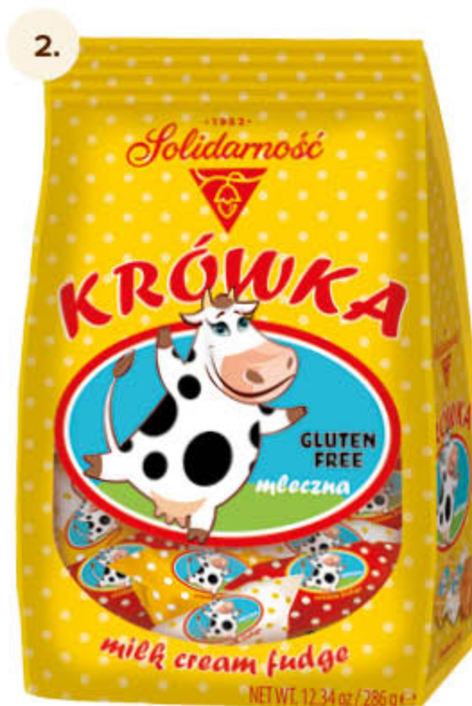
Cream fudge** 286 g