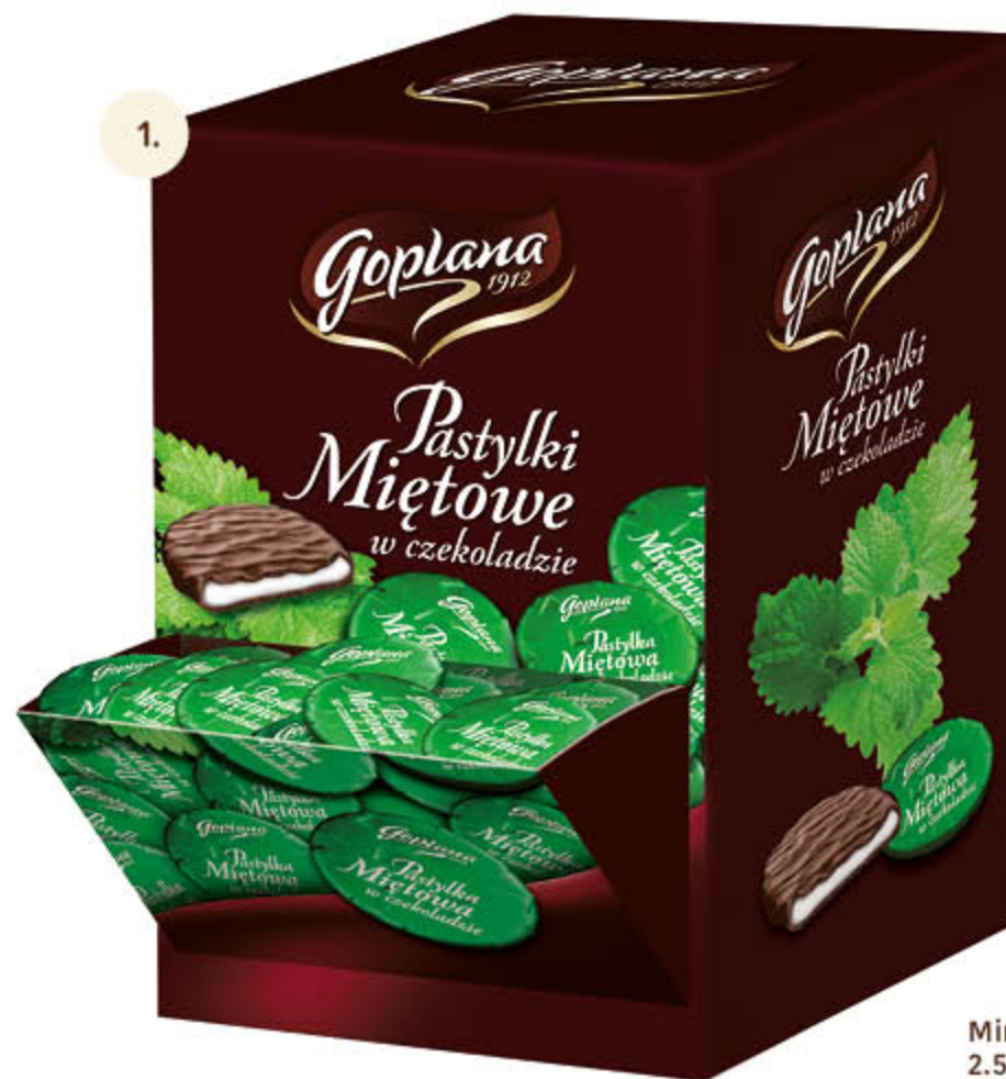
Mint Pralines 2.5 kg