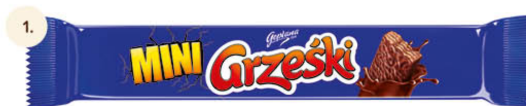
Grzeński Mini Wafer with cocoa cream in chocolate 20 g