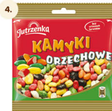
Sugar coated peanuts 100 g