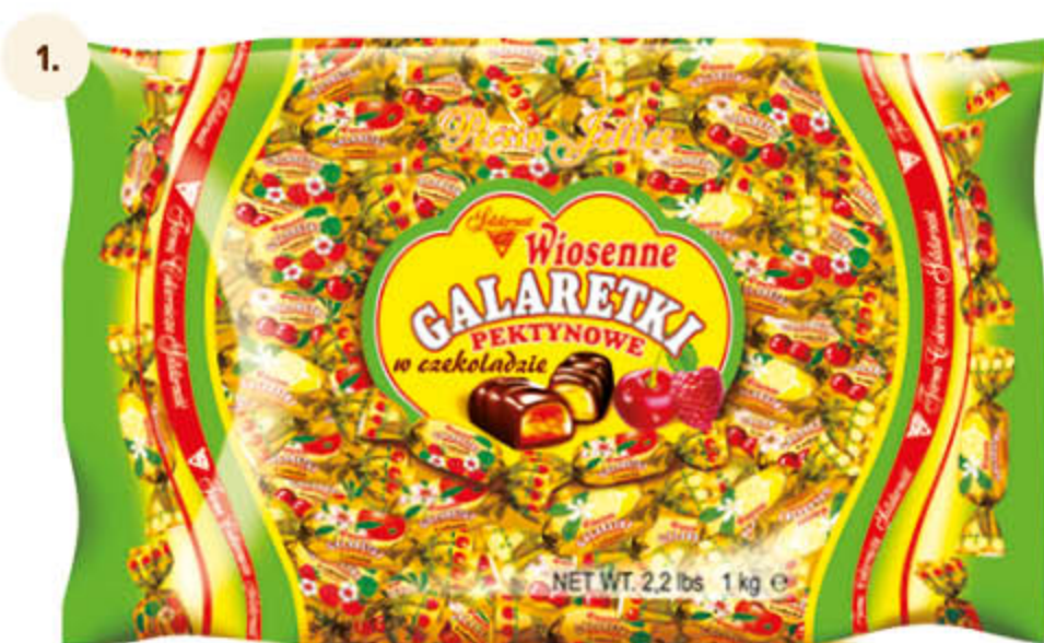
Wiosenne – pectin jellies in chocolate mix 1 kg