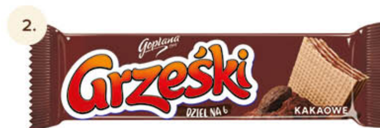
Wafer with cocoa cream 26 g