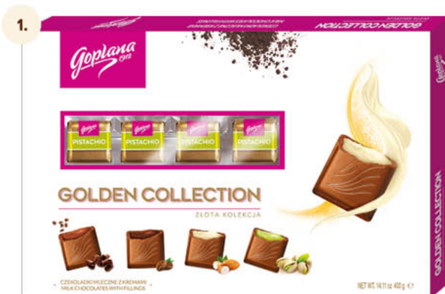
Golden Collection Assorted filled chocolates* 400 g