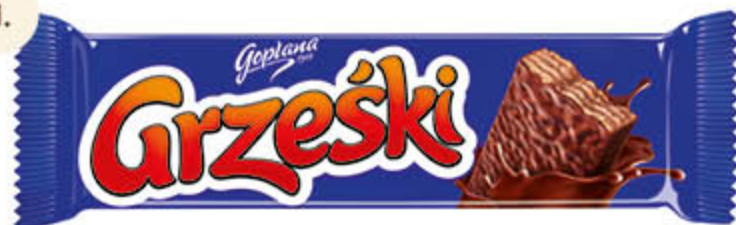
Grzeński Wafer with cocoa cream in chocolate 36 g