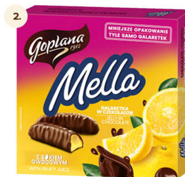
Jelly in dark chocolate with lemon flavour 190 g