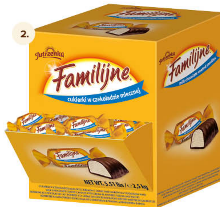
Familijne - Milk chocolate coated candies with cream-flavoured filling and wafers 2.5 kg