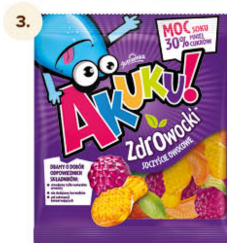
Akuku! Zdrowocki – Fruit jellies with fruit filling with reduced content of sugars 90 g