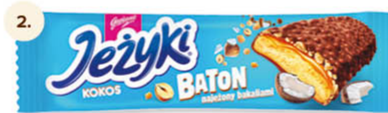
Biscuits with caramel & coconut in milk chocolate 30 g