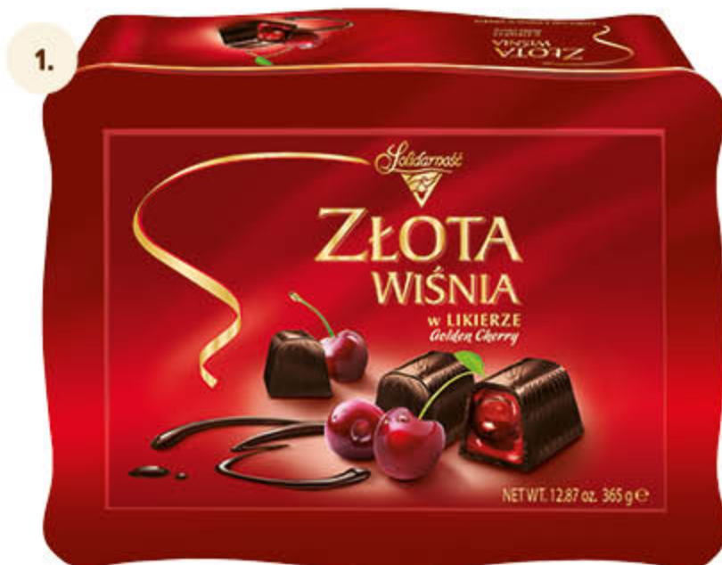
Golden Cherry* (tin) 365 g