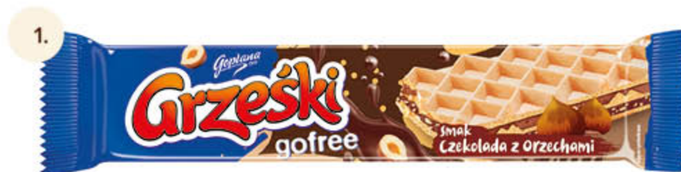
Gofree chocolate wafers with pieces of hazelnuts 33 g