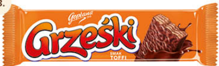
Grzeński Wafer with toffee flavoured cream in milk chocolate 36 g