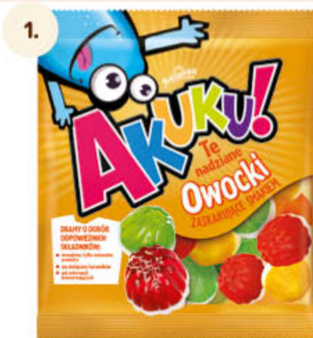
Akuku! Owocki – Fruit jellies with fruit filling 90 g