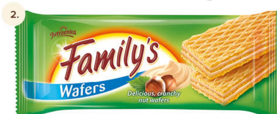
Family's wafers with hazelnut cream 180 g