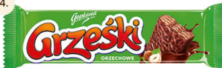
Grzeński Wafer with hazelnut cream in milk chocolate 36 g