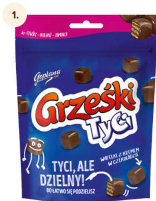
Grzeński Tyci – dark chocolate 120 g