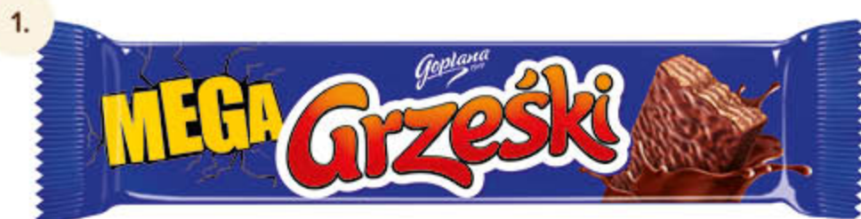
Grzeński Mega Wafer with cocoa cream in chocolate 48 g