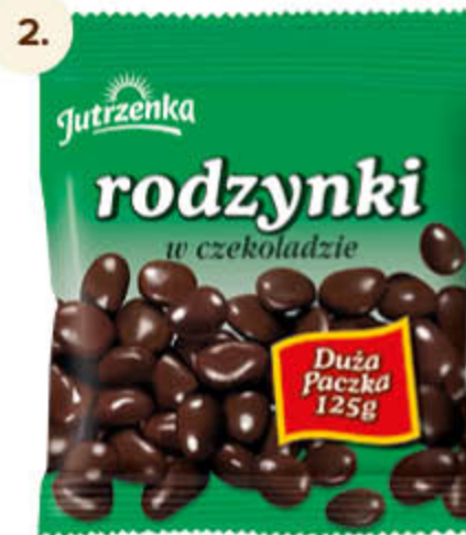
Raisins in chocolate 125 g