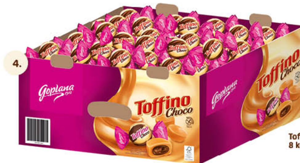
4. Toffino Choco** 8 kg