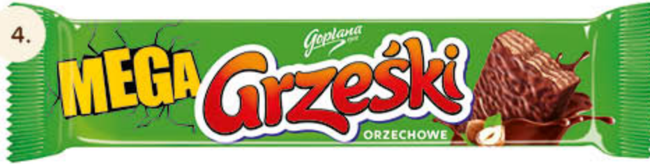
Grzeński Mega Wafer with hazelnut cream in milk chocolate 48 g