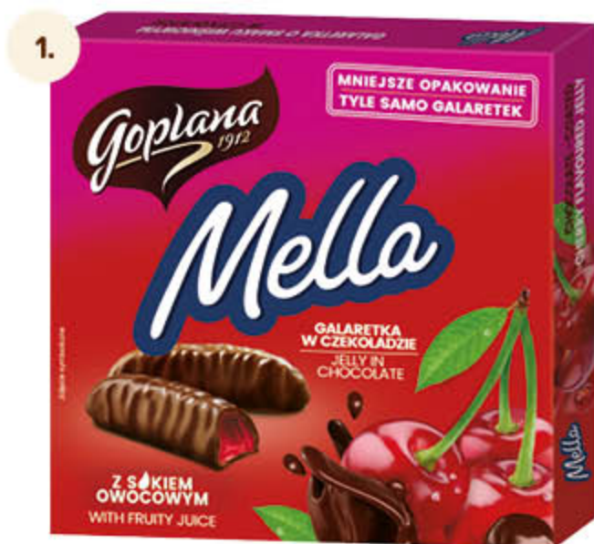
Jelly in dark chocolate with cherry flavour 190 g