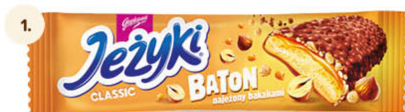
Biscuits with caramel & nuts in milk chocolate 30 g