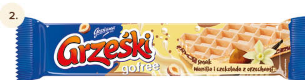
Gofree vanilla-chocolate wafers with pieces of hazelnuts 33 g