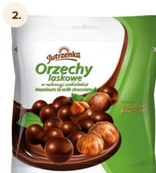
Hazelnuts covered with dark chocolate 80 g