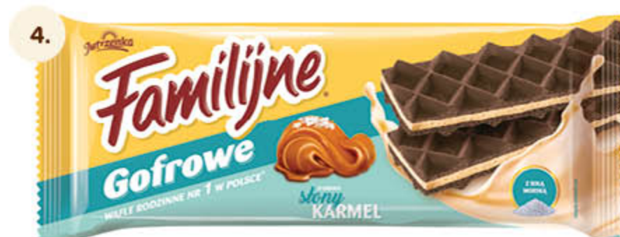
4. Familijne EXTRA CRUNCHY - salted caramel 140 g