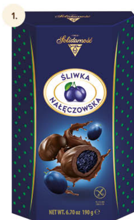
Naleczowska Plum in chocolate** 190 g