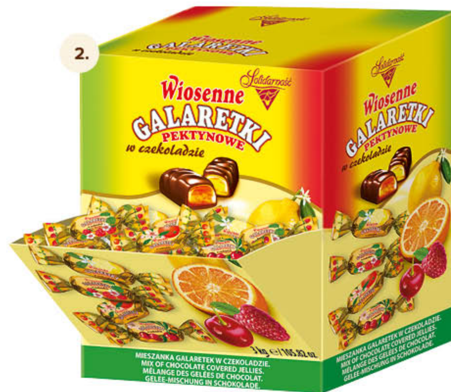
Wiosenne – pectin jellies in chocolate mix 3 kg