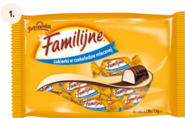
Familijne - Milk chocolate coated candies with cream-flavoured filling and wafers 1 kg