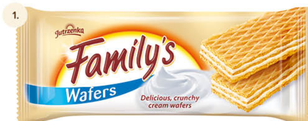
Family's wafers with cream cream 180 g