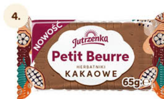
Petit Beurre cocoa Biscuits 65 g