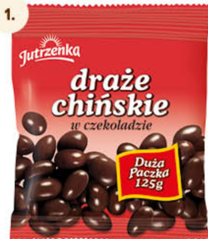
Dragees in chocolate 125 g