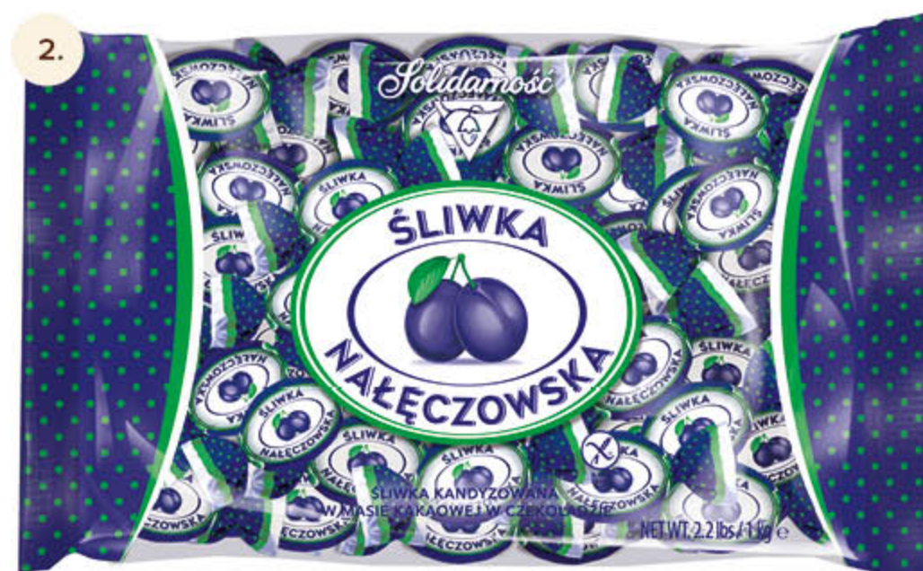
Naleczowska Plum in chocolate** 1 kg