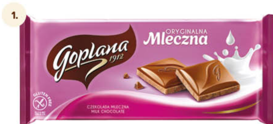
Original Milk chocolate** 90 g