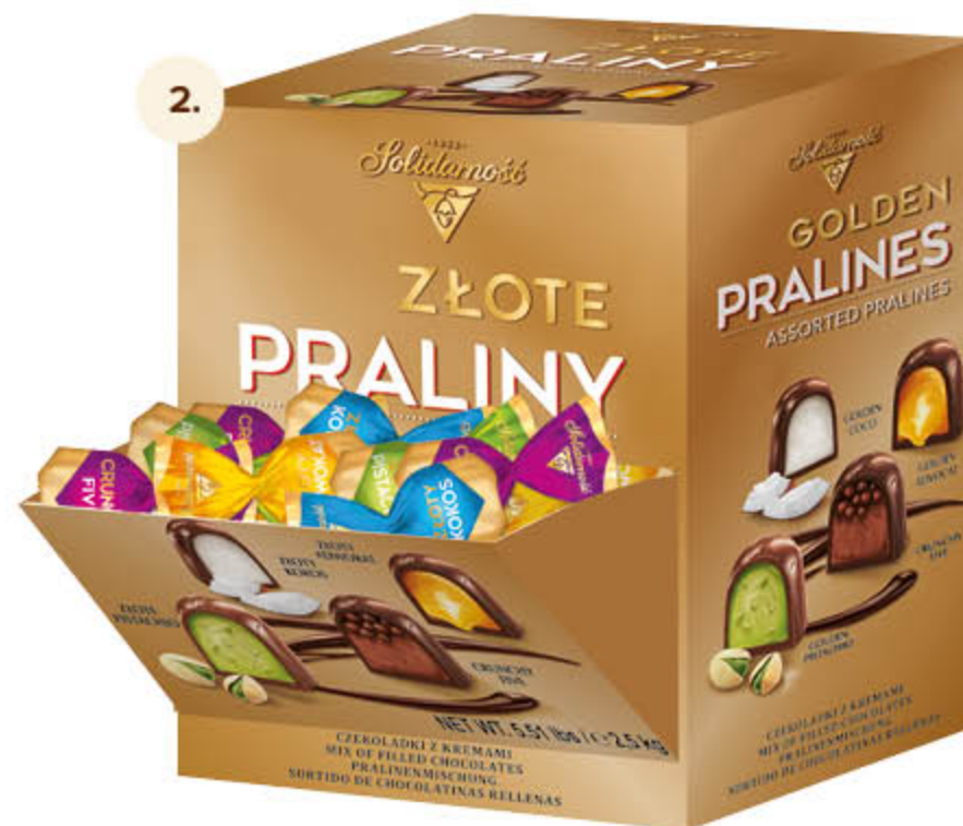
Golden Pralines Mix* 2.5 kg