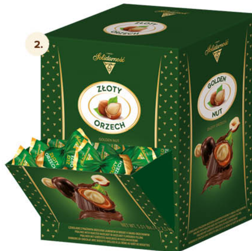
Golden Nut Pralines with hazelnut 2.5 kg