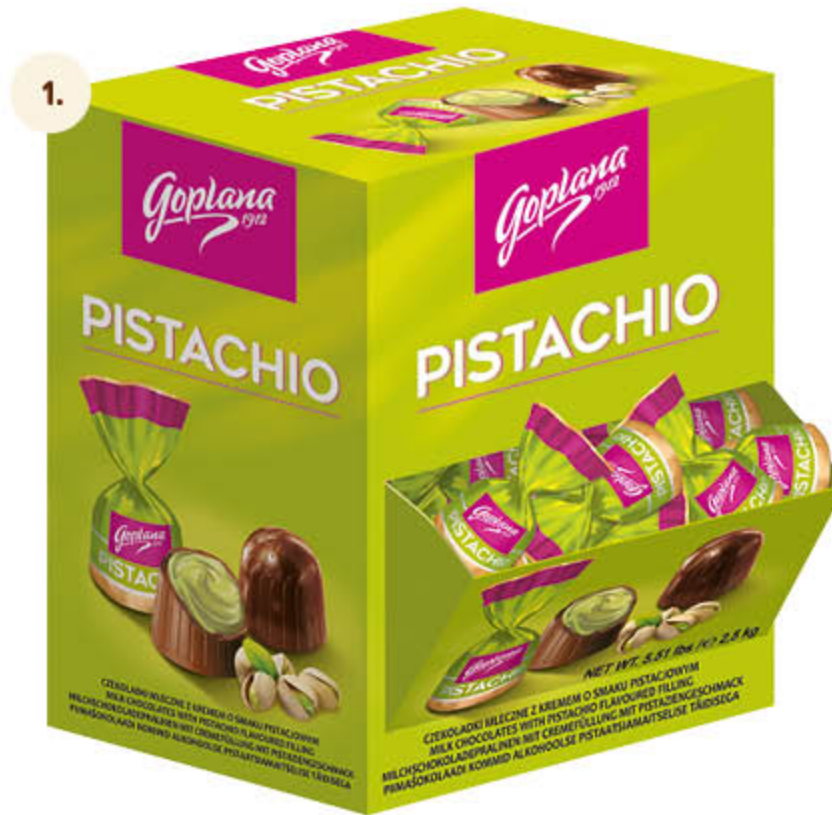
Pistachio - Assorted filled pralines 1 kg*