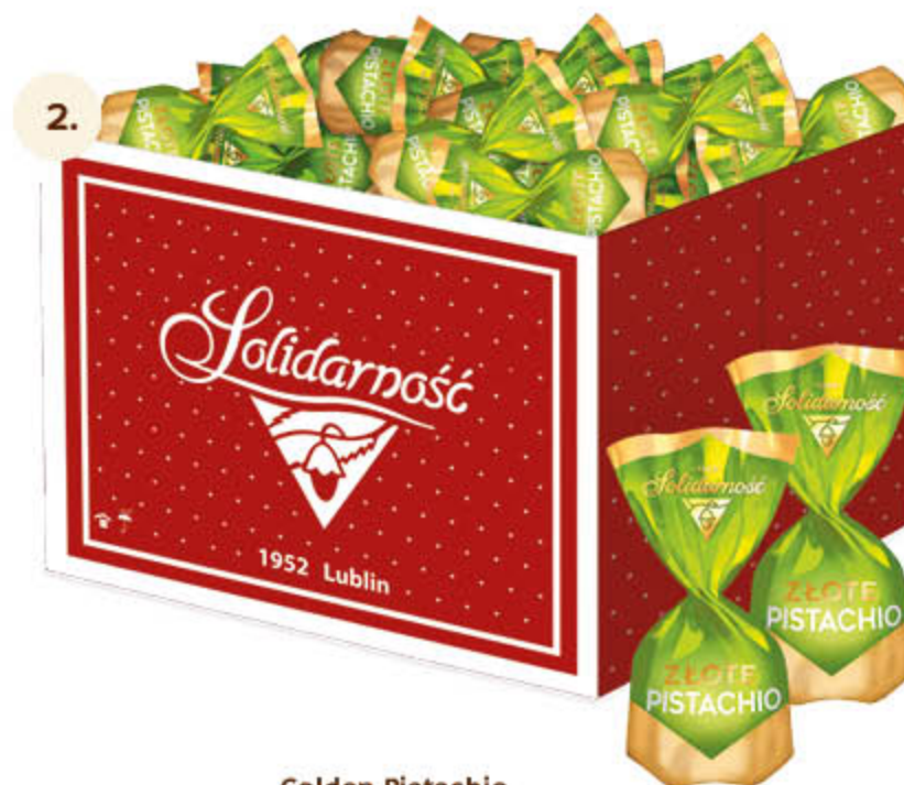
Golden Pistachio 2.5 kg