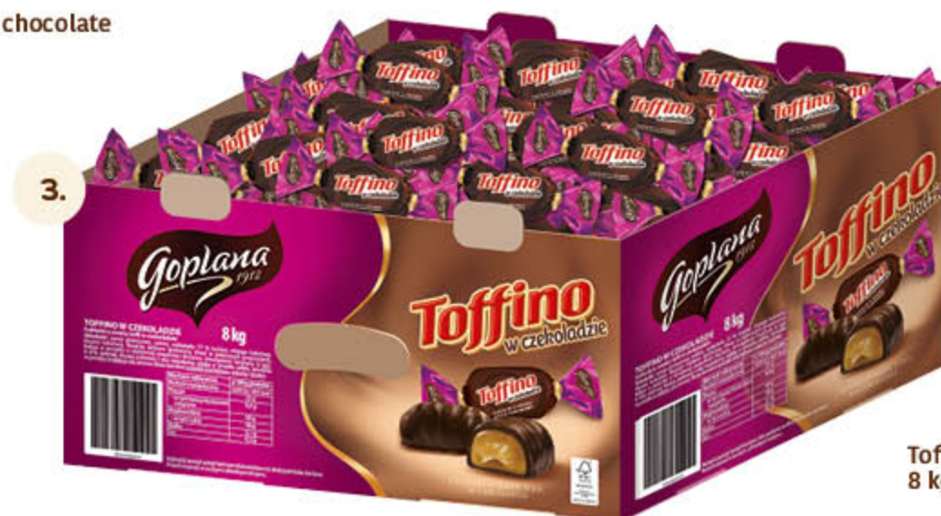
Toffino in chocolate 8 kg