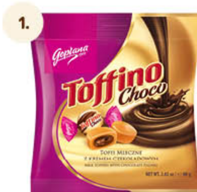
1. Toffino Choco** 80 g