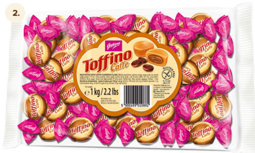
Toffino Caffè** 1 kg