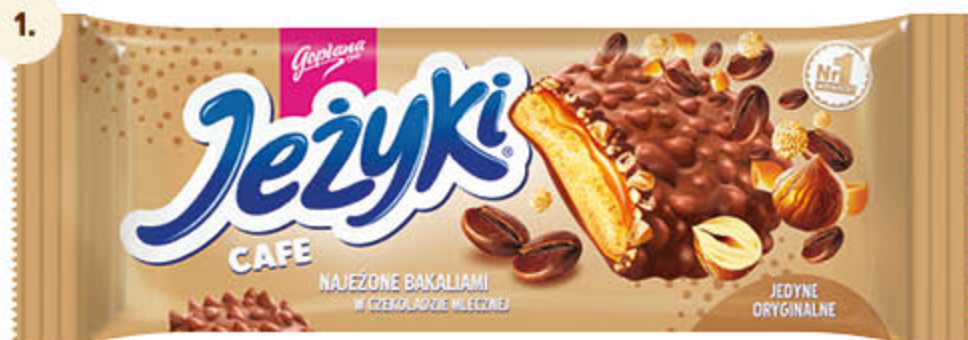
Biscuits with caramel & coffee, nuts in milk chocolate 140 g