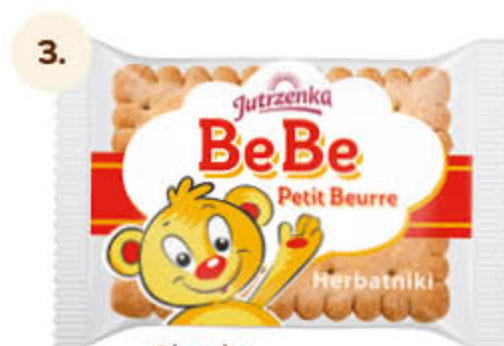
Biscuits Be-Be 16 g