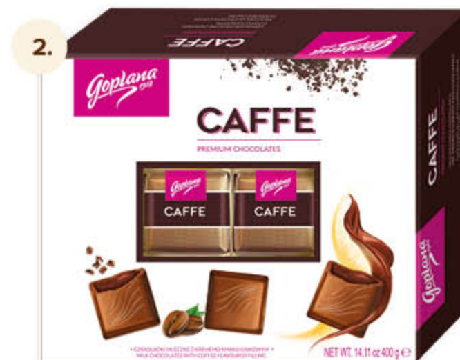
Caffe Milk chocolates with coffee filling* 400 g