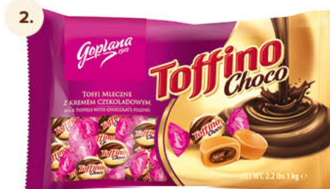
2. Toffino Choco** 1 kg