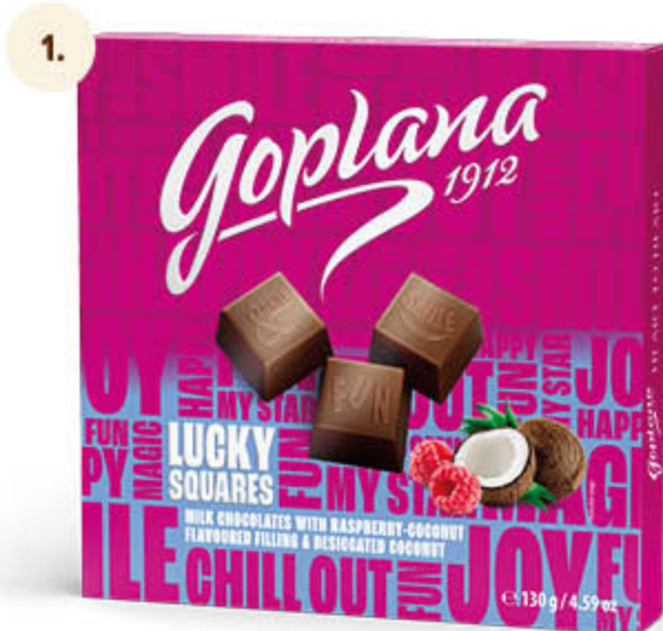
LUCKY SQUARES Milk chocolates with raspberry – coconut flavoured filling & desiccated coconut 130 g