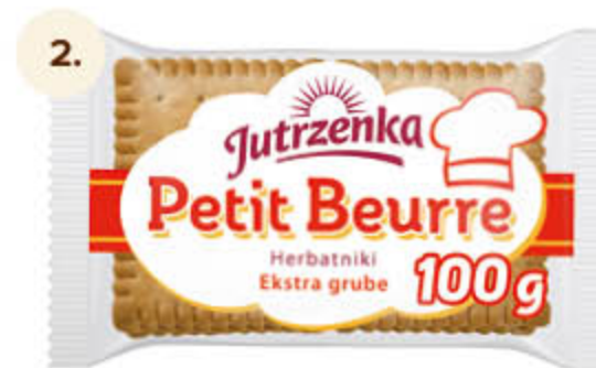
Petit Beurre Biscuits 100 g