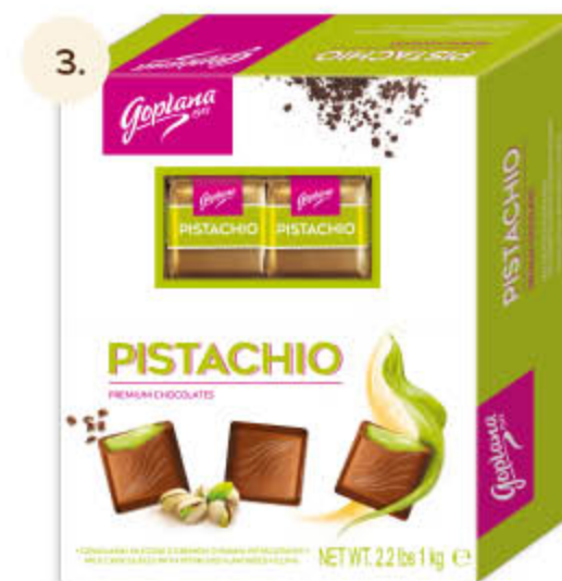
Pistachio milk chocolates with pistachio flavoured filling* 1000 g