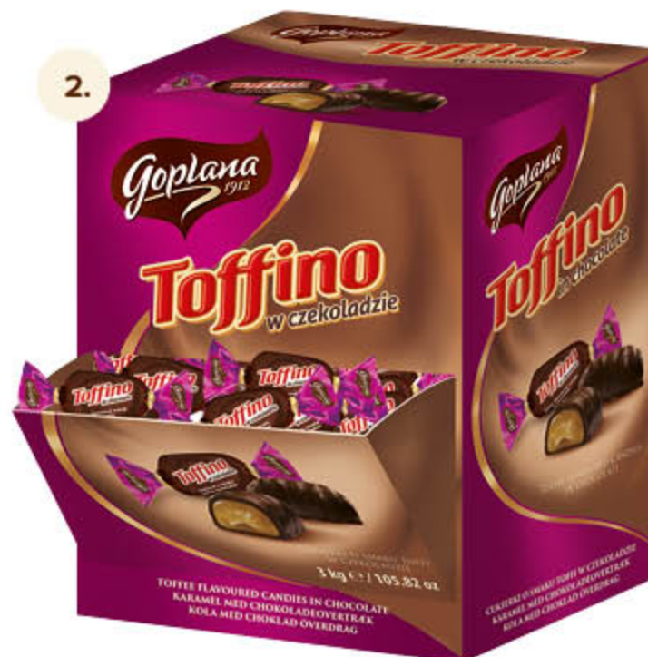
Toffino in chocolate 3 kg