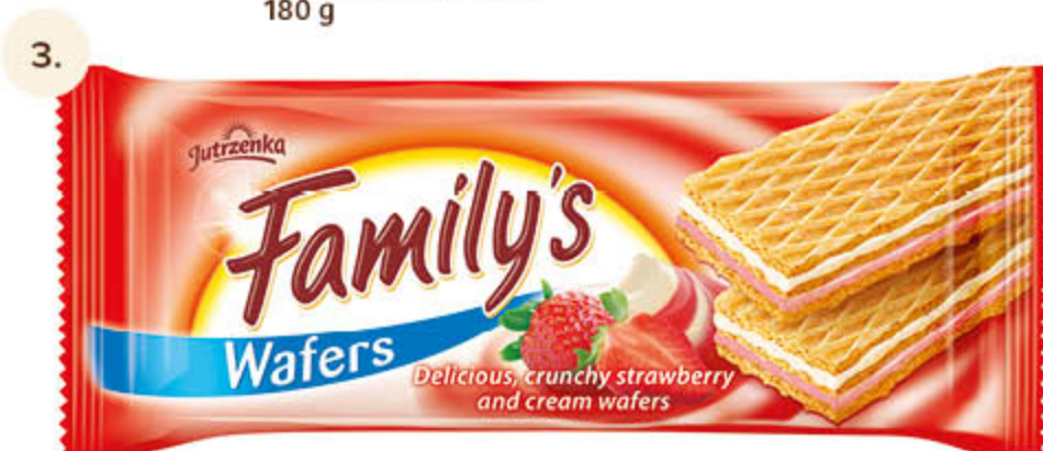
Family's wafers with strawberry cream 180 g