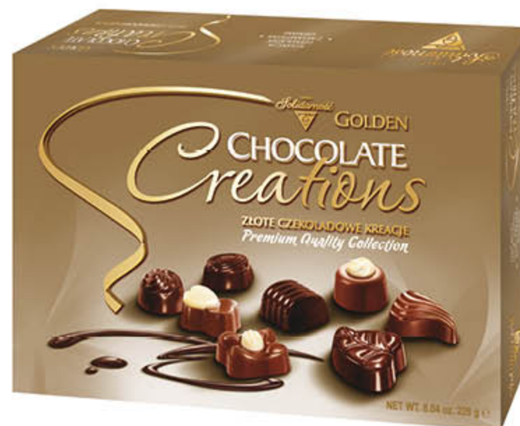
Golden Chocolate Creations Assorted filled pralines mix 228 g