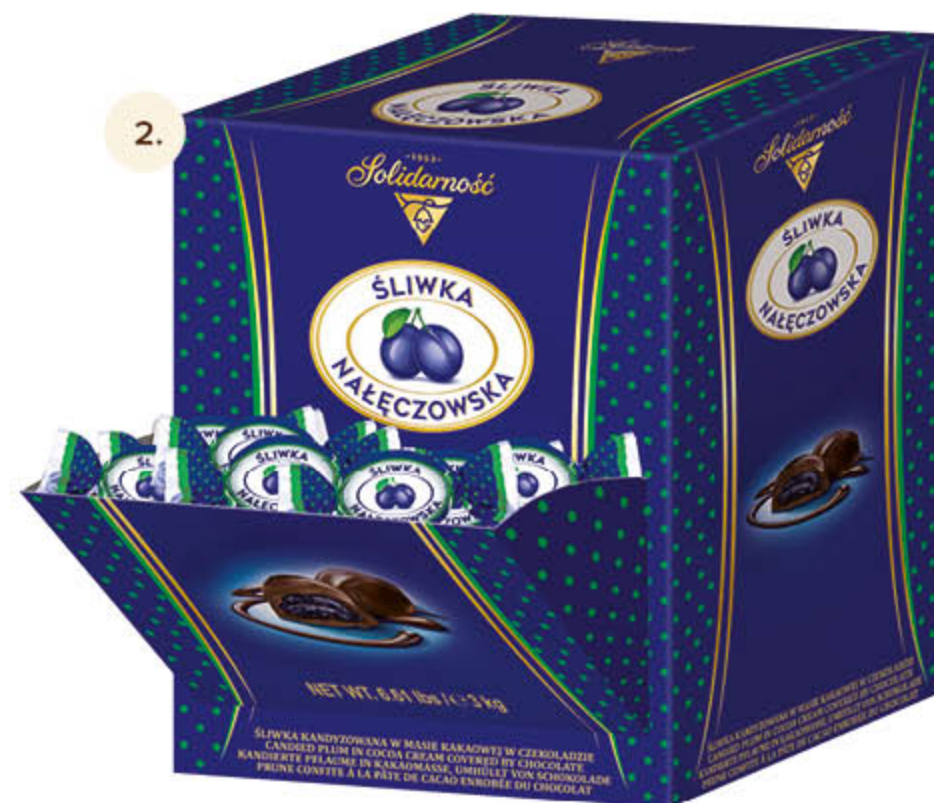
Naleczowska Plum in chocolate** 3 kg