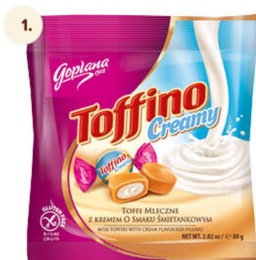
Toffino Creamy** 80 g