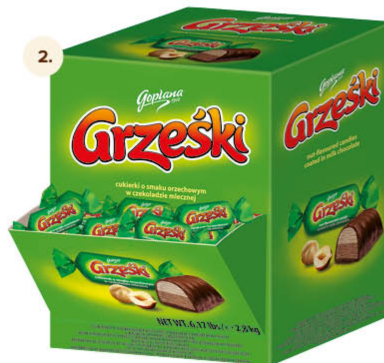
Grzeński. Milk chocolate coated candies with cream with the addition of wafers and nut flavoured cream 2.5 kg