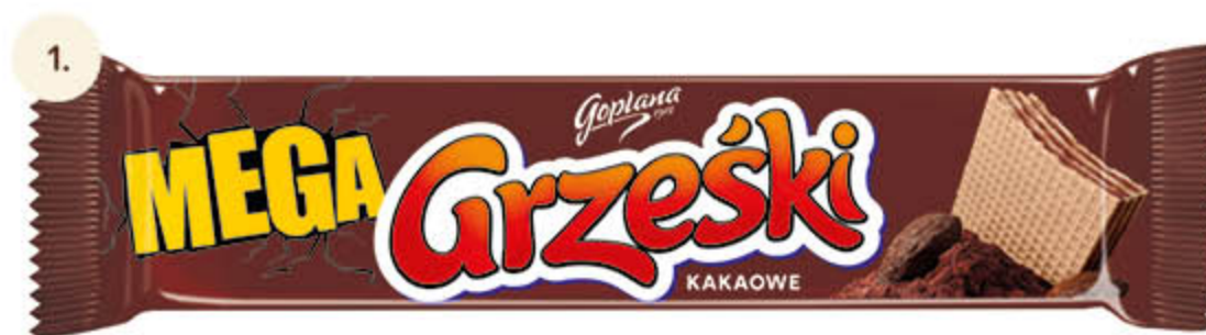
Grzeński Mega Wafer with cocoa cream 34 g