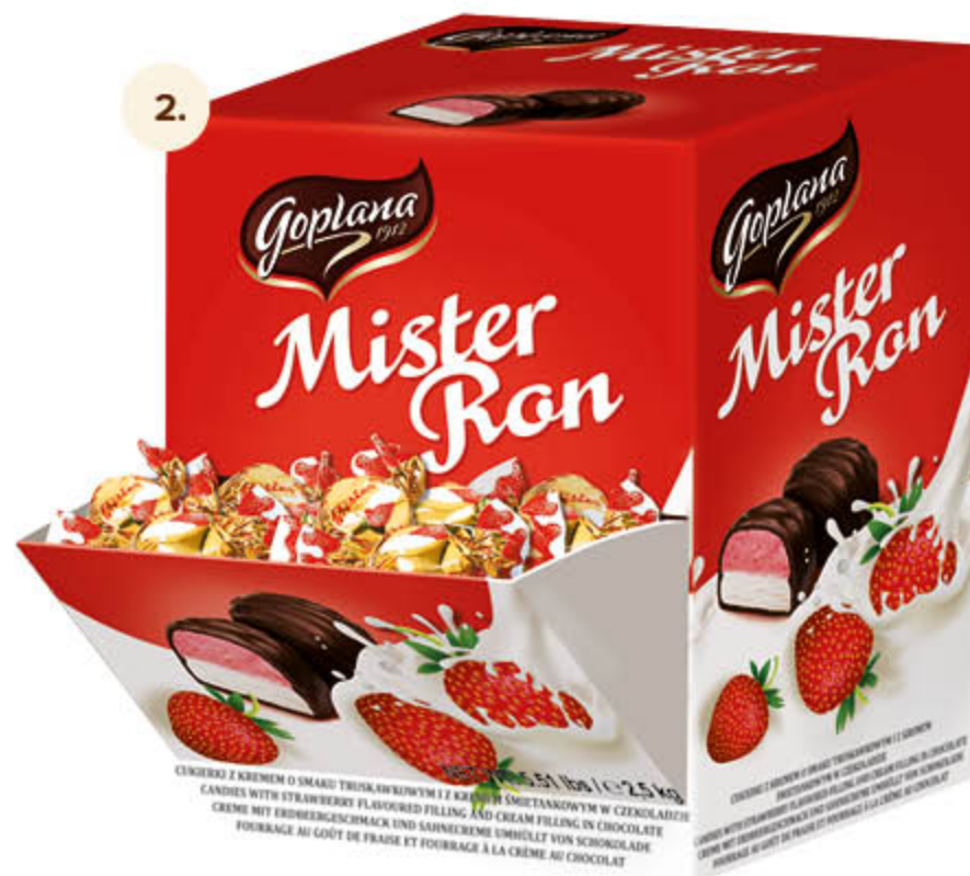
Mister Ron Strawberry-cream 2.5 kg