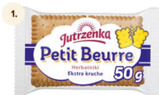
Petit Beurre Extra crisp biscuits 50 g