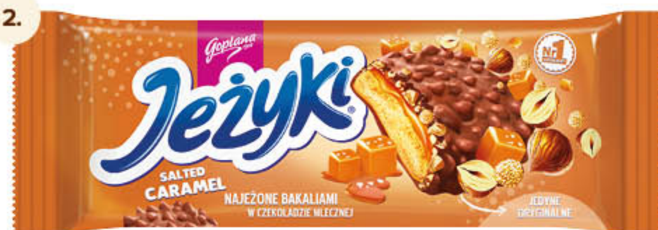
Biscuits with salty caramel & nuts in milk chocolate 140 g