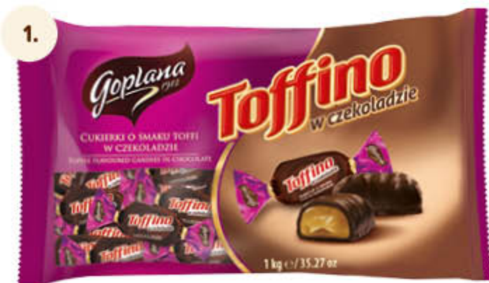
Toffino in chocolate 1 kg