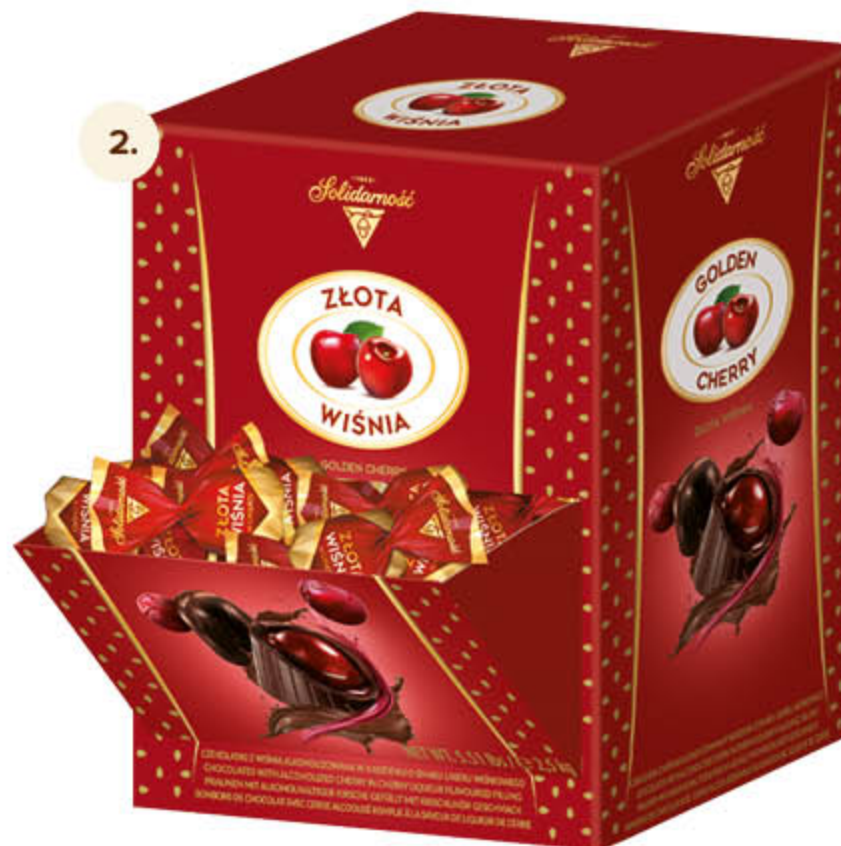
Golden Cherry* 2.5 kg