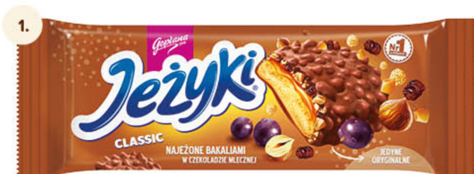
Biscuits with caramel, raisins & nuts in milk chocolate 140 g