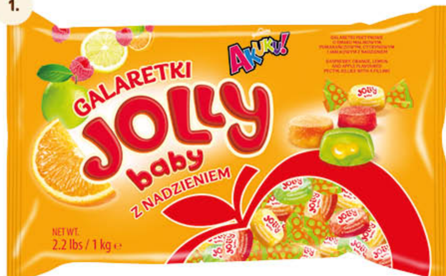
Jolly Baby – Jellies with fillings** 1 kg