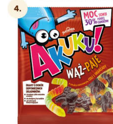
Akuku! Wąż-Paje – Fruit jellies with fruit filling with reduced content of sugars 90 g