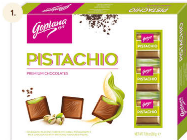
Pistachio milk chocolates with pistachio flavoured filling* 200 g