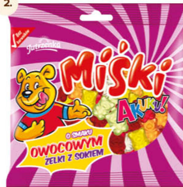
Jelly bears with fruity juices 90 g