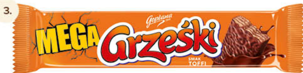
Grzeński Mega Wafer with toffee flavoured cream in milk chocolate 48 g