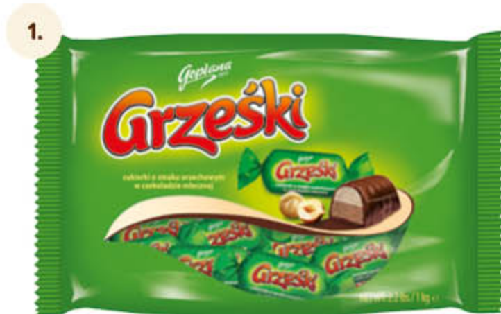
Grzeński. Milk chocolate coated candies with cream with the addition of wafers and nut flavoured cream 1 kg