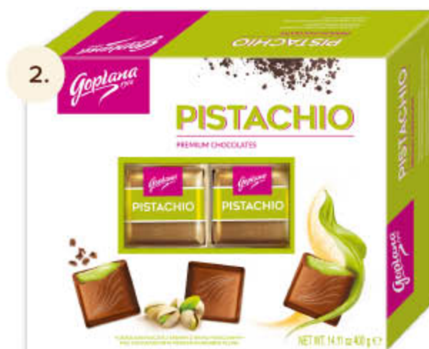
Pistachio milk chocolates with pistachio flavoured filling* 400 g