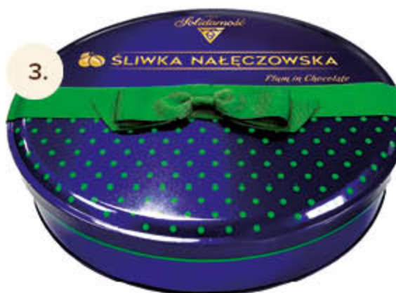
3. Naleczowska Plum in chocolate** 250 g