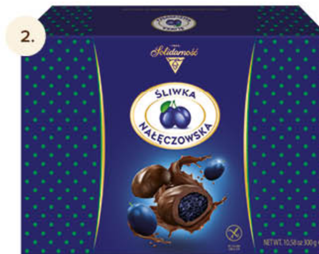
2. Naleczowska Plum in chocolate** 300 g