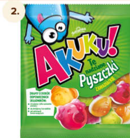
Akuku! Pyszczki – Fruit jellies with fruit filling 90 g