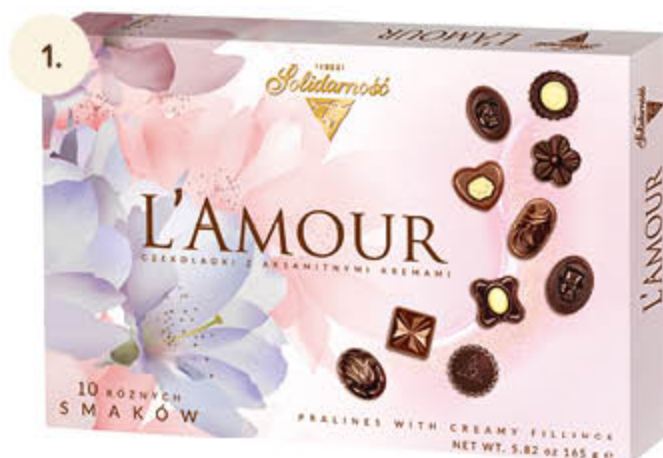
L'Amour Assorted filled pralines 165 g