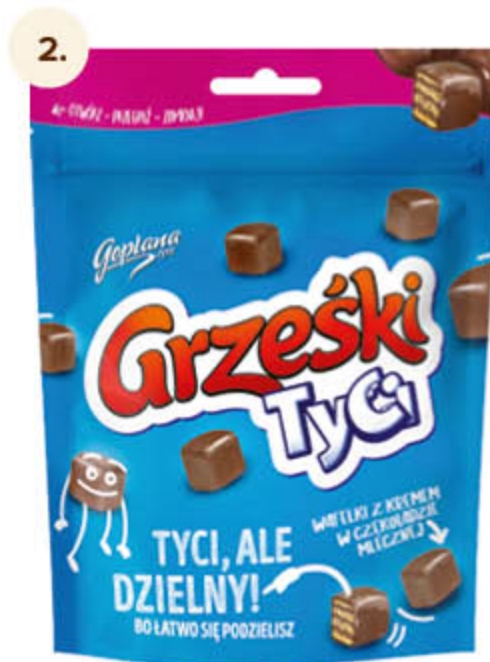
Grzeński Tyci – milk chocolate 120 g