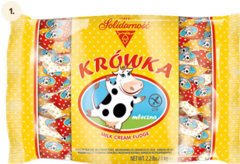
Cream fudge** 1 kg