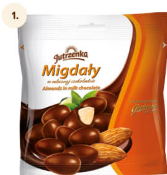
Almonds covered with milk chocolate 80 g