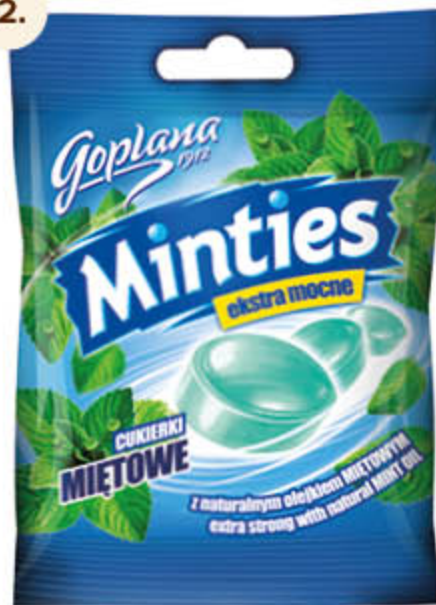
Hard caramel with natural mint oil - extra strong** 90 g