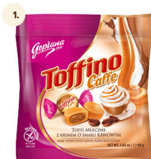
Toffino Caffè** 80 g