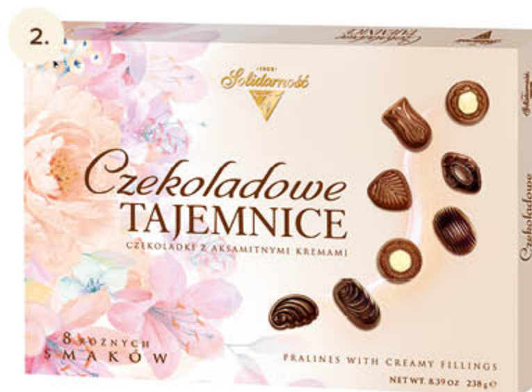
Chocolate Secrets Assorted filled pralines 238 g