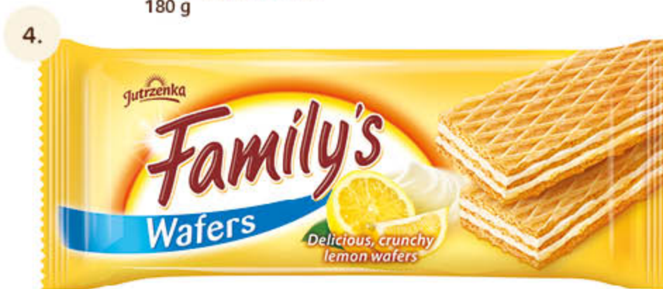
Family's wafers with lemon cream 180 g