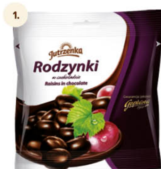
Raisins covered with dark chocolate 80 g