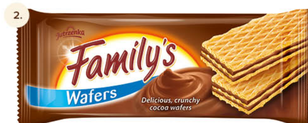
Family's wafers with cocoa cream 180 g