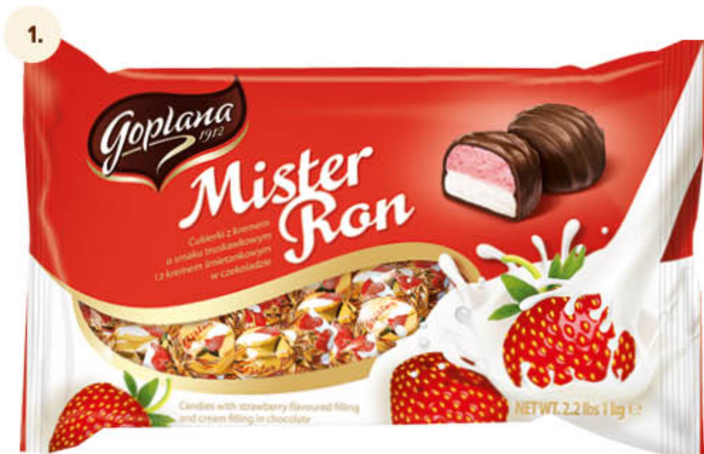
Mister Ron Strawberry-cream 1 kg