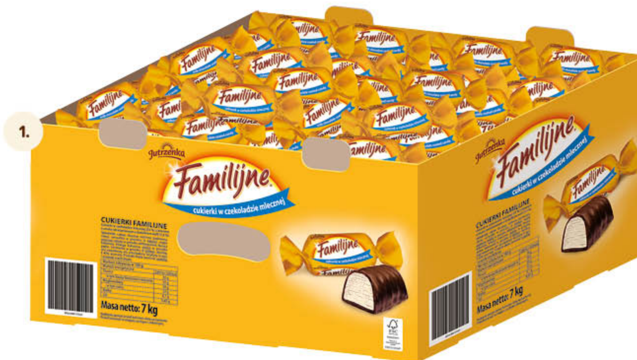
Familijne - Milk chocolate coated candies with cream-flavoured filling and wafers 7 kg