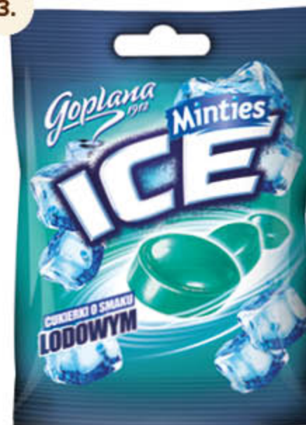
Ice - hard caramels** 90 g