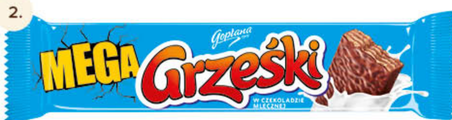
Grzeński Mega Wafer with cocoa cream in milk chocolate 48 g