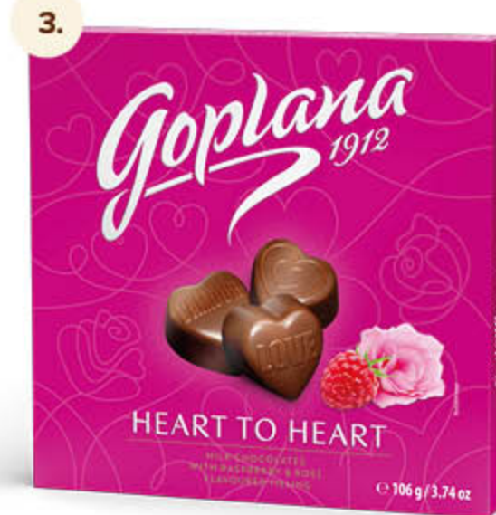
HEART TO HEART Milk chocolates with raspberry & rose flavoured filling 106 g