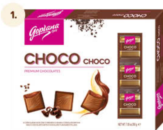
Choco-Choco Milk chocolates with chocolate flavoured filling* 200 g