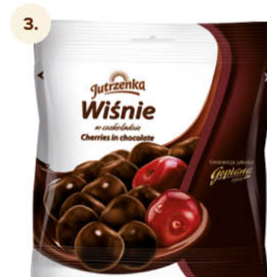
Cherry covered with dark chocolate 80 g