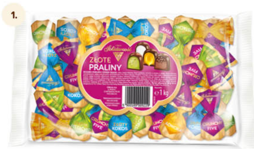
Golden Pralines Mix* 1 kg