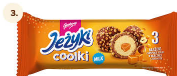
Jezyki Coolki MILK 140.4 g