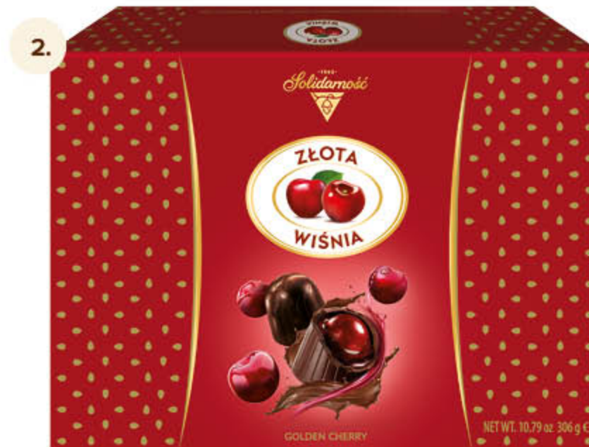
Golden Cherry* (box) 306 g