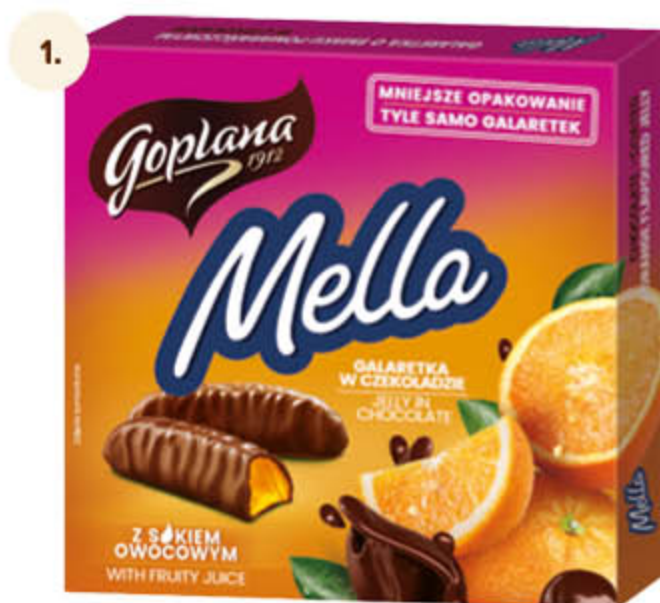
Jelly in dark chocolate with orange flavour 190 g