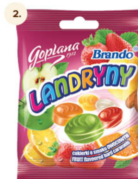
Fruit flavoured hard caramels** 90 g