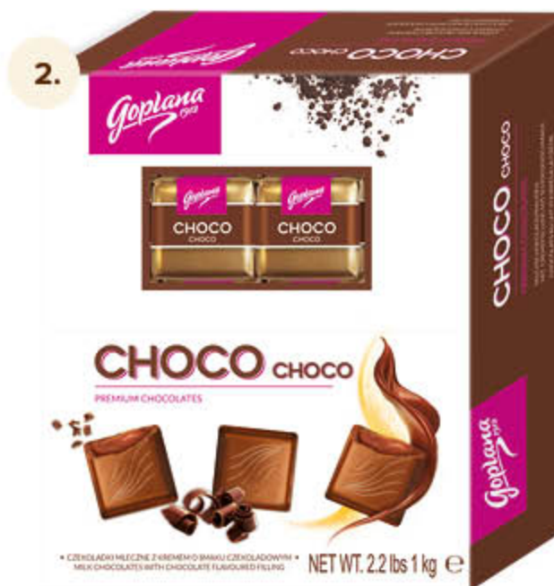
Choco-Choco Milk chocolates with chocolate flavoured filling* 1 kg