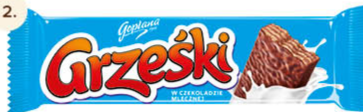
Grzeński Wafer with cocoa cream in milk chocolate 36 g