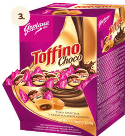
3. Toffino Choco** 2.5 kg