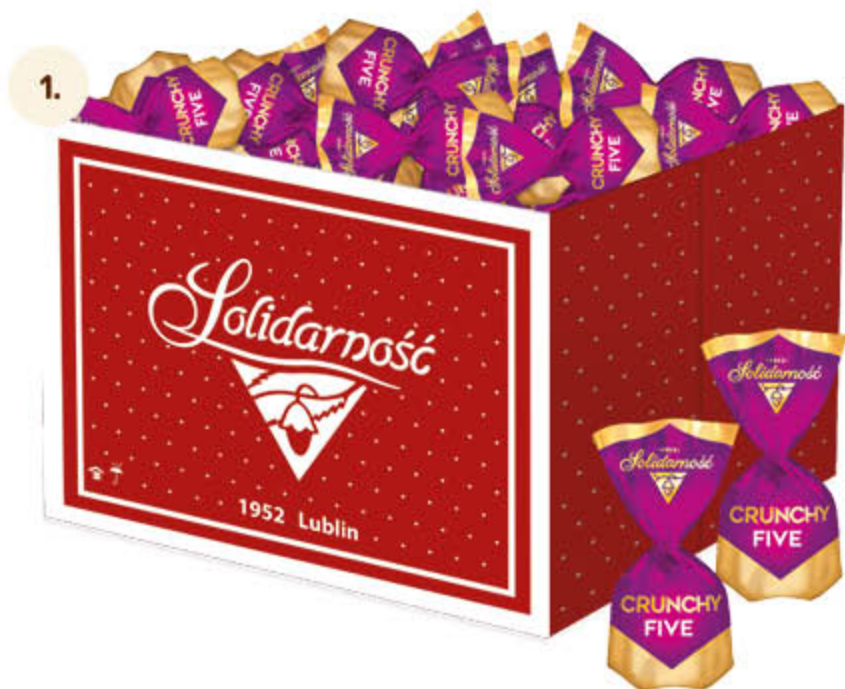
Crunchy Five 2.5 kg