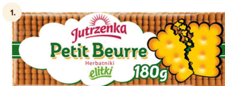
Petit Beurre Elitki Biscuits 180 g