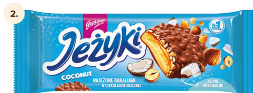
Biscuits with caramel & coconut in milk chocolate 140 g