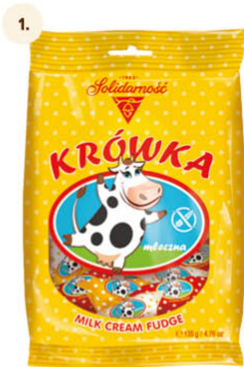
Cream fudge** 135 g