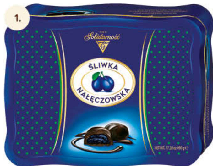
1. Naleczowska Plum in chocolate** (tin) 490 g