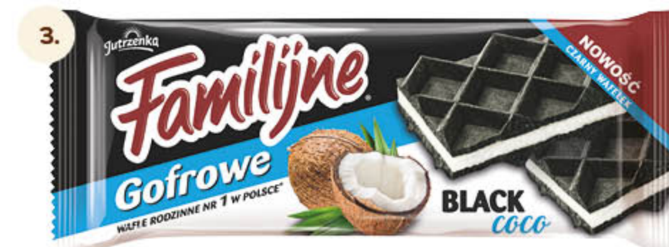
3. Familijne EXTRA CRUNCHY - black coconut 140 g