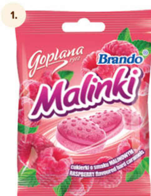
Raspberry flavoured hard caramels** 90 g