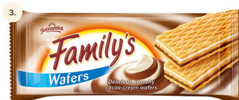
Family's wafers with cocoa&cream cream 180 g