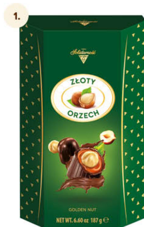
Golden Nut Pralines with hazelnut 187 g