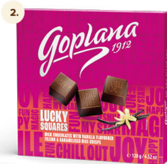
LUCKY SQUARES Milk chocolates with vanilla flavoured & caramelised rice crisps 128 g