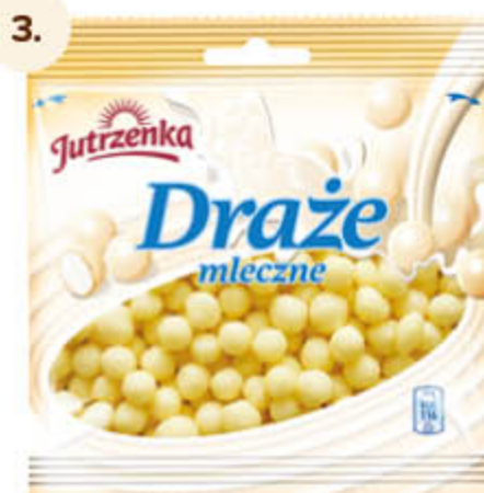
Milk dragees 80 g