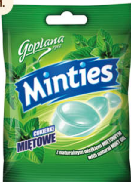
Hard caramel with natural mint oil** 90 g