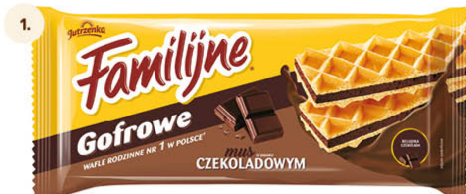
1. Familijne EXTRA CRUNCHY - chocolate 130 g