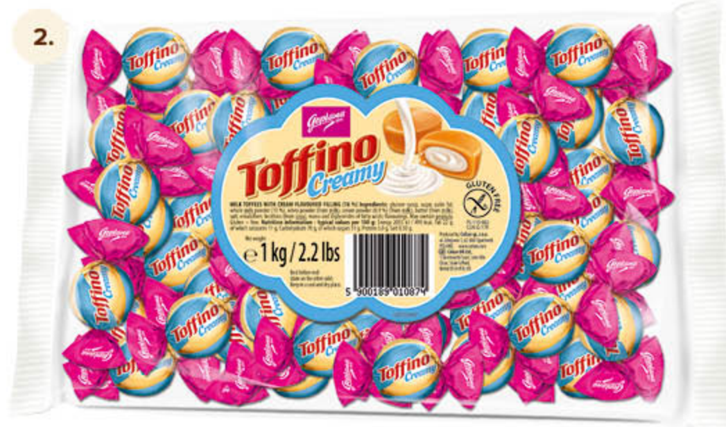
Toffino Creamy** 1 kg