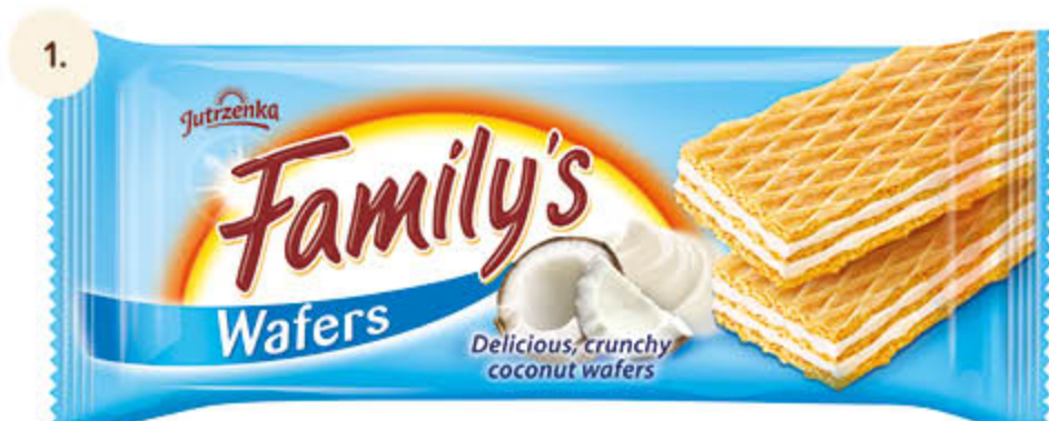
Family's wafers with coconut cream 180 g